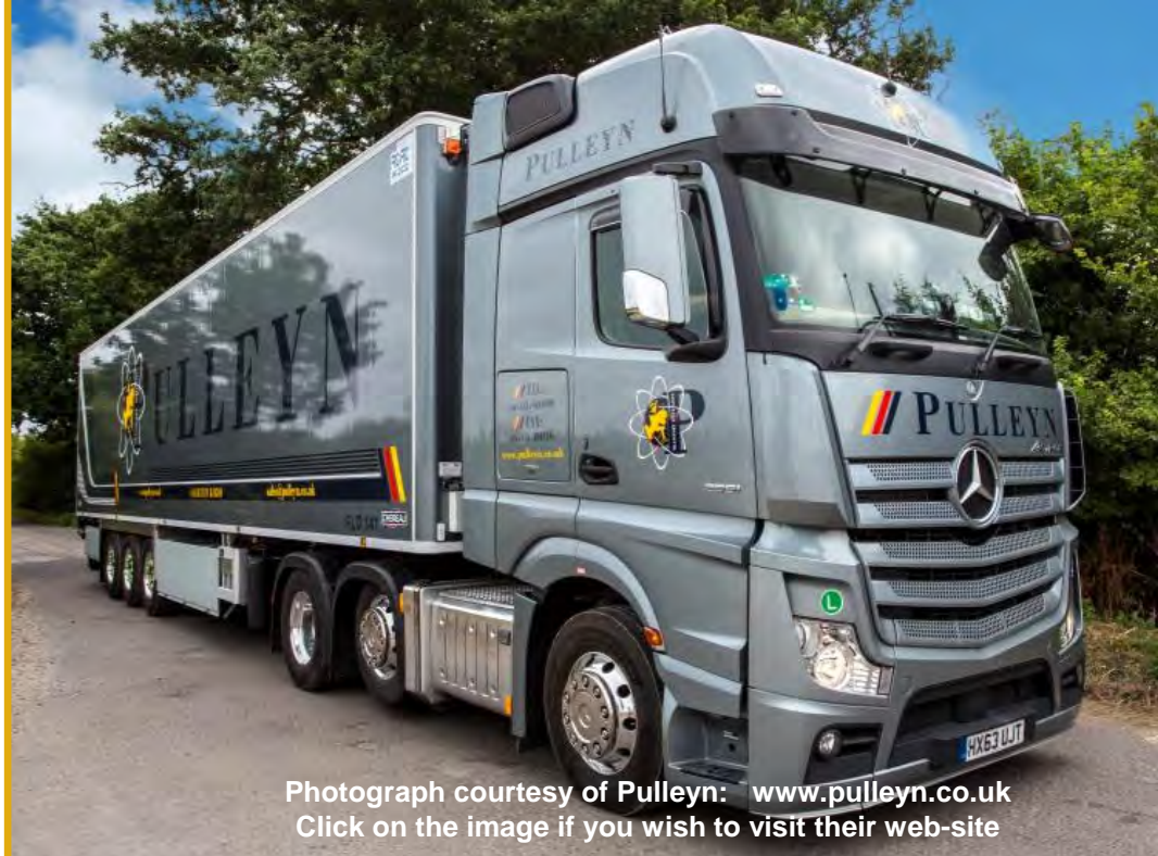
Click on the image if you wish to visit their web-site