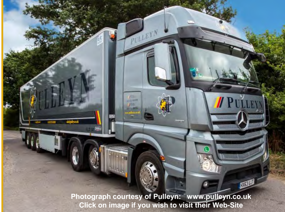
Click on image if you wish to visit their Web-Site